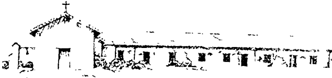
MISSION NUESTRA SENORA DE LA SOLEDAD FOUNDED 1791